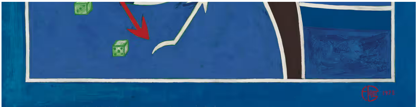
Gilot's painting Magic Games, 1978

In France at least, however, her success has always been overshadowed by the man considered one of the most important artists of the 20th century.