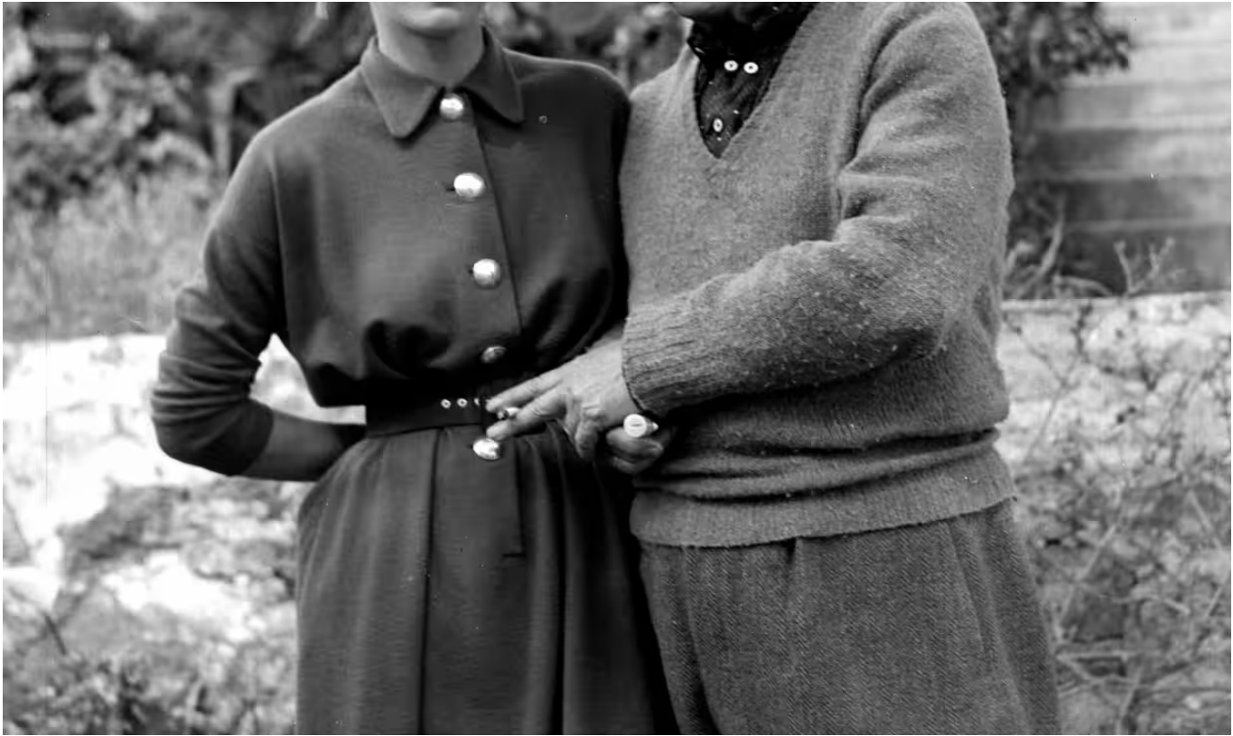
Gilot split from Picasso in 1953, sparking a wave of harassment, and in later life divided her time between Paris and New York.

In many ways France treated Gilot even worse than Picasso did . While he launched three lawsuits to prevent publication of her 1964 biography, Life with Picasso , 80 prominent intellectuals and artists signed a petition in the communist paper Les Lettres Françaises calling for the book to be banned. The book sold a million copies and was translated into 16 languages, but the shunning of her work was what she described as a “civil death”.